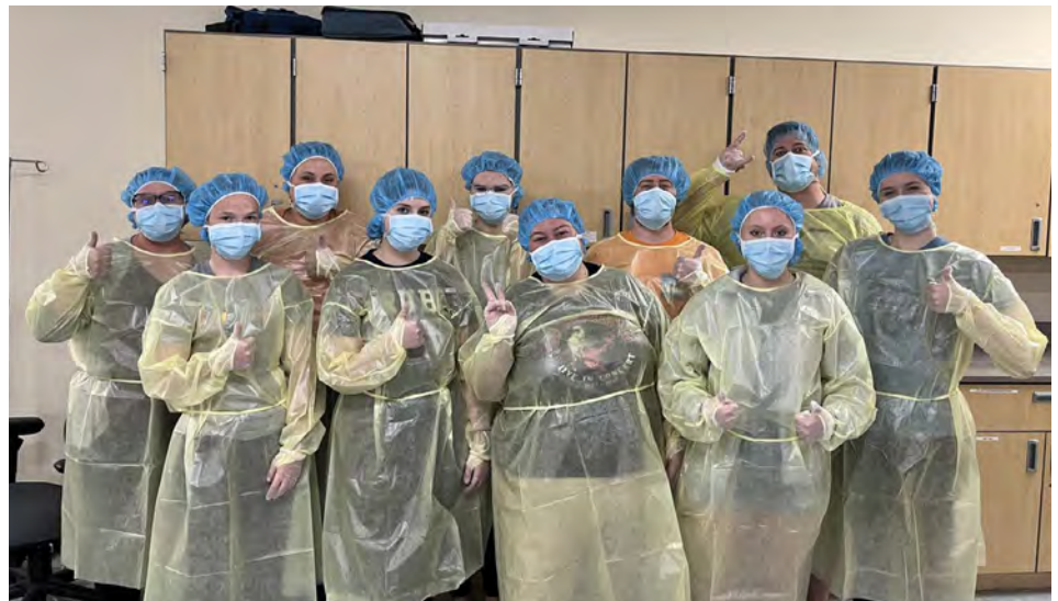
HCC Radiography Students show off their lab gear!

And through the support of the ARC grant, the Radiography Program at HCC is poised to continue its tradition of excellence, providing students with the resources they need to succeed in the rapidly evolving healthcare field.