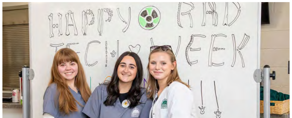
HCC Radiography Students celebrating RAD Tech week!

The new equipment will directly translate to the students' clinical experiences. By using the O.R. table in conjunction with a mobile C-arm machine, students will participate in mock O.R. scenarios, gaining valuable hands-on practice. As they observe, practice, and perform these procedures on campus, they will be better prepared for the challenges of their clinical rotations.