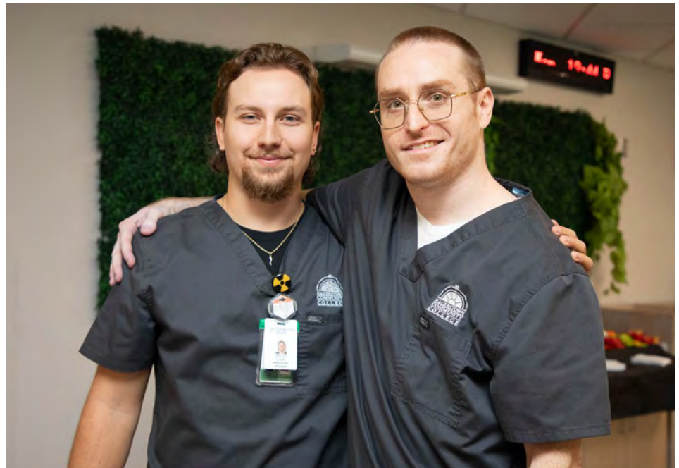
HCC Radiography Students, Class of 2025

Would you like to make a difference in the lives of our students? Donate towards your preferred scholarship fund today at hagerstowncc.edu/giving .