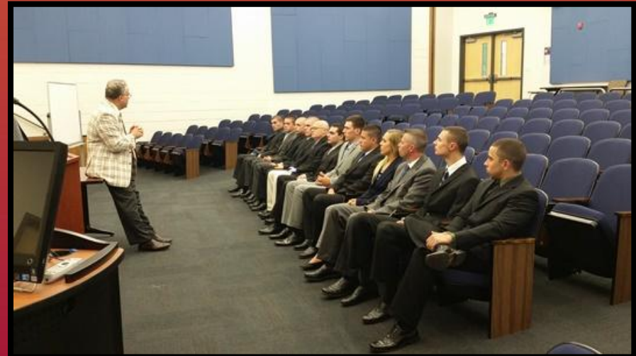
HCC Welcomes New Police Academy Recruits July 6, 2015