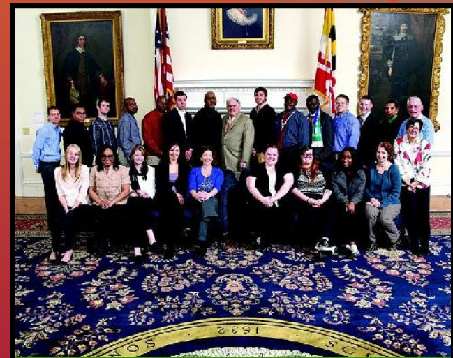
HCC's Business Club in Annapolis