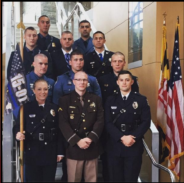
Police Academy Graduates June 26, 2015