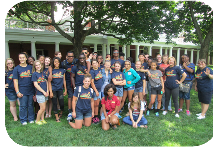
July Field Trip: Students visited the University of Virginia (UVA) during the 2014 Summer Academy. UVA is the only university in the United States that is a World Heritage Site, as designated by the United Nations Educational, Scientific, and Cultural Organization. Students were surprised to hear that it was of extreme privilege to live in the original rooms on campus as a senior because the rooms still do not have plumbing. For some students living in the original dormitories (pictured directly behind the group below), it is a mile to the nearest bathroom.