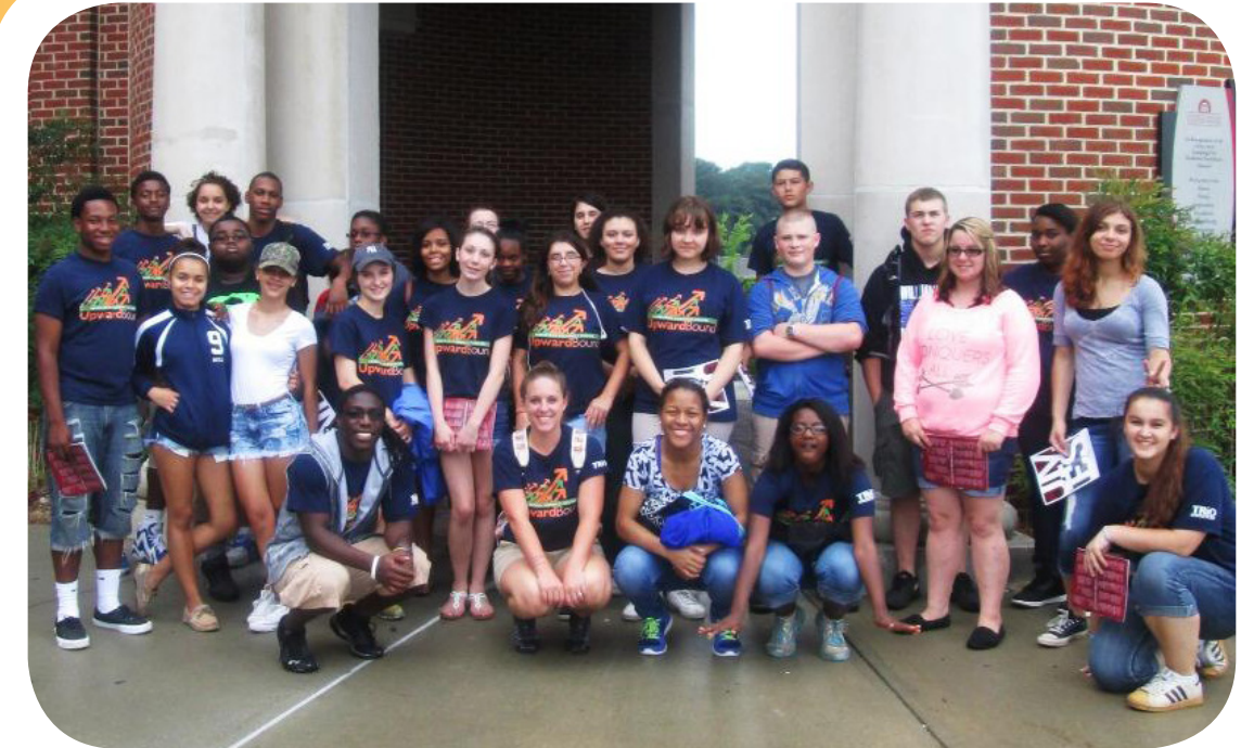
Upward Bound students visited the University of Maryland Eastern Shore for an information session and campus tour in July. UMES has a fully functioning farm on campus as part of their Agricultural and Natural Sciences programs.