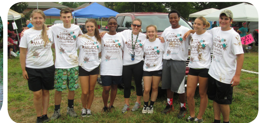
Students who cleaned up the park then climbed to the top of the Washington Monument after learning about the detailed history.