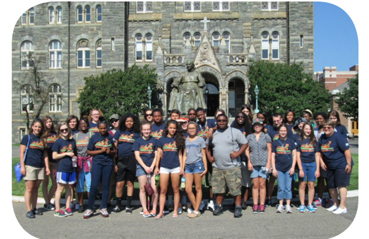
June Field Trip: Students and staff pose in front of the John Carroll Statue at Georgetown University in Washington, D.C., during an Upward Bound college tour. Georgetown University has the largest student-run business and largest student-run banking program in the country.