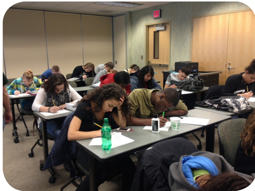
Spring 2014 Saturday Sessions: Students attend a maximum of 10 Saturday Sessions during the academic year on the campus of HCC. Upward Bound staff work with students to review informational topics including, but not limited to: the financial aid process and applying for scholarships, the college application process, preparing for college entrance exams (i.e., SAT and ACT), and career research. Students are provided bus transportation to and from the activity, as well as breakfast and lunch.