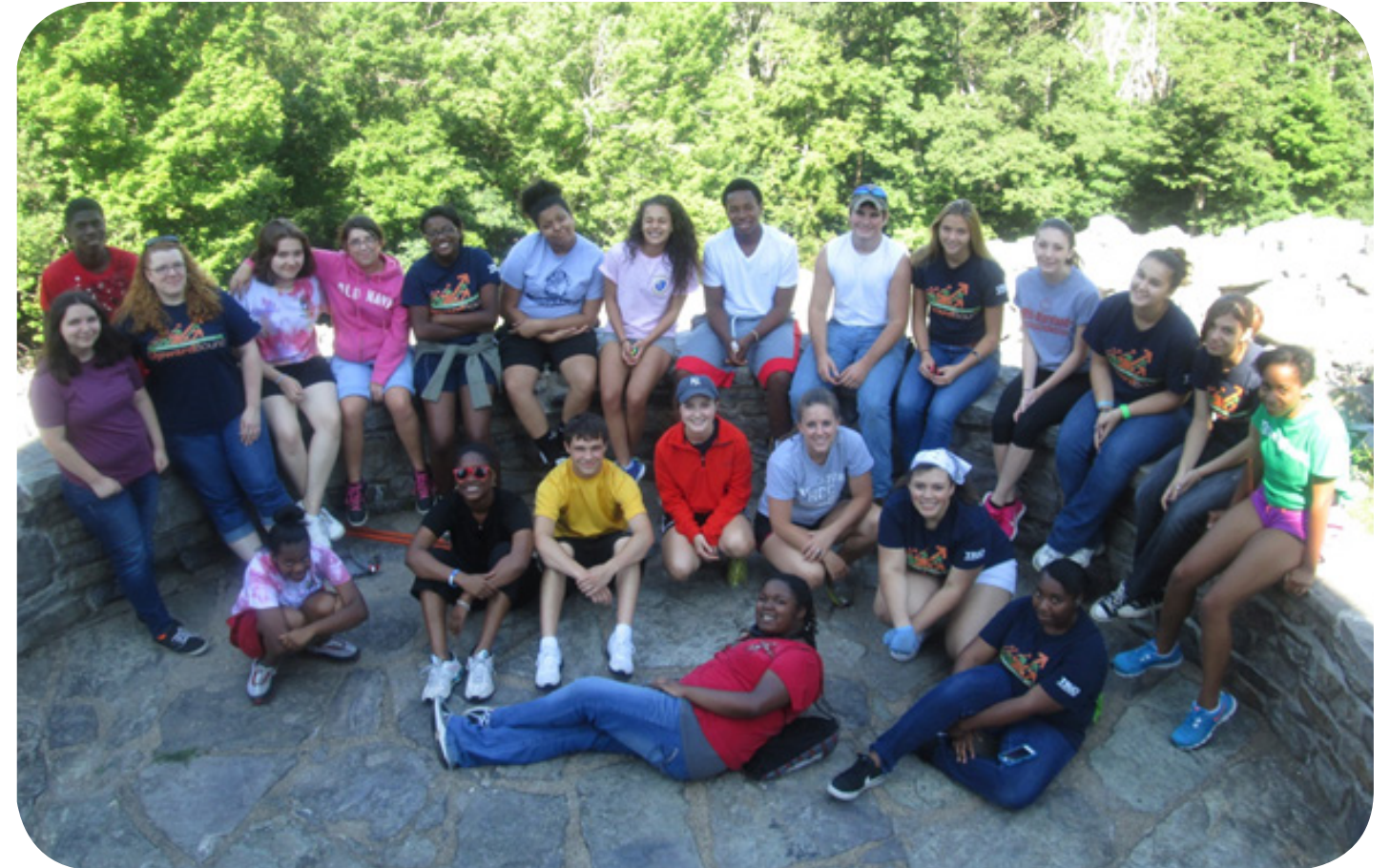
Students volunteered to help staff run the annual MUDD Volleyball Tournament to benefit the Community Free Clinic.

also receive Student Service Learning hours that count towards their high school graduation.