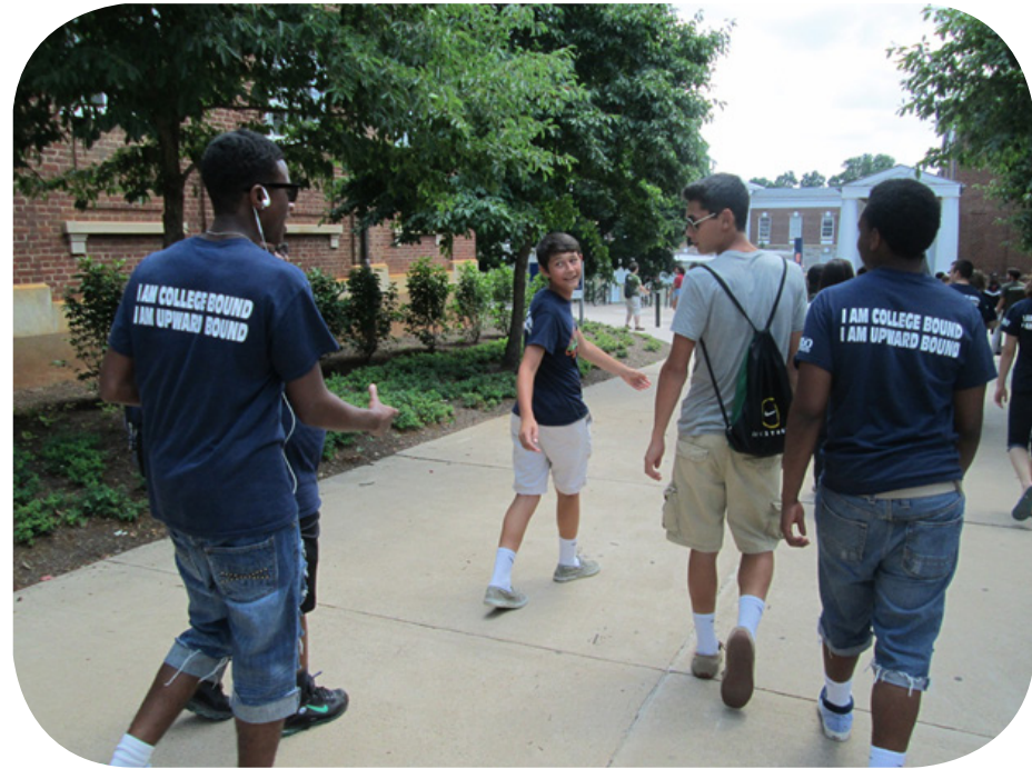
Participant t-shirts are given to students each year to wear during field trips and other UB activities.

Program Website: www.hagerstowncc.edu/upwardbound