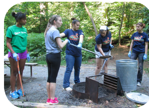
Students cleaned up the Washington Monument State Park in Middletown, MD.